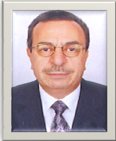
Vice President & General Manager Nesma Trading Co. Ltd.

I would like to congratulate the Toastmasters Club of Nesma on their 1st Anniversary, which shall be celebrated on 5 th June 2008.