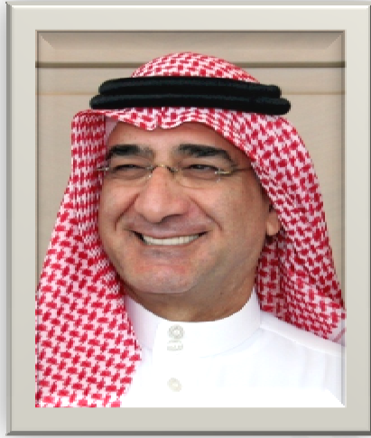
Chairman NESMA Holding Co. Ltd.