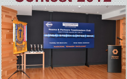
Champion-International Speech Contest Ziad Bou Alwan