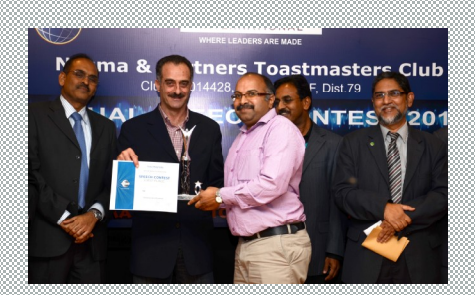
Champion-Table Topics Speech Contest Riyadh Al Alwan