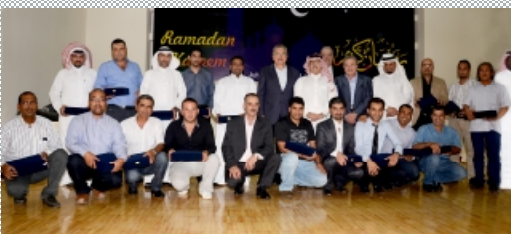
Award winners with the dignitaries

Recently two new projects have been awarded to Nesma & Partners Contracting Co. Ltd. by Sadara Chemical Company: