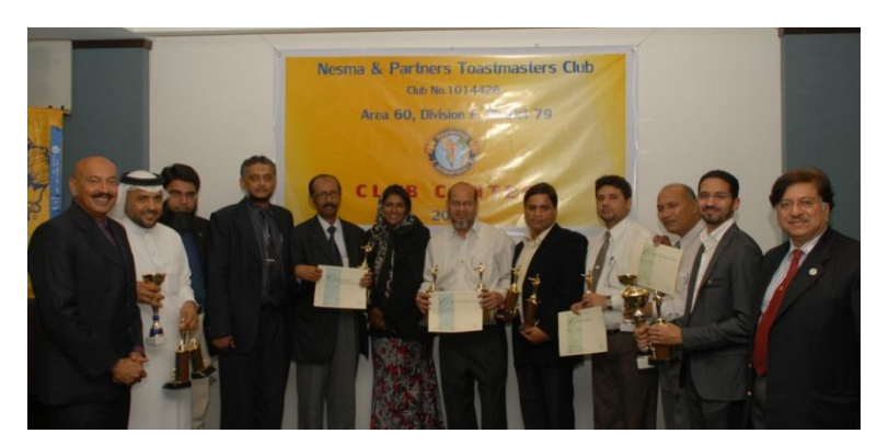
Winners along with the Div. F Governor, Area 60 Governor, Area 9 Governor, Chief Judge and Contest Chairperson