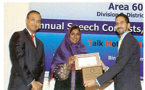
Area 60 Division F, District 79